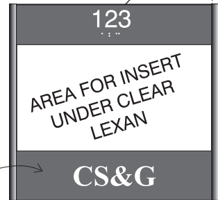
Front View (Format A Illustrated)

Removable End Cap Secured With Obscure Set Screws On Side