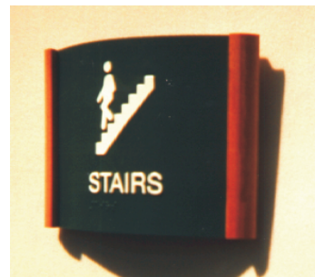
One Piece Thin Photopolymer Insert ADA Compliant