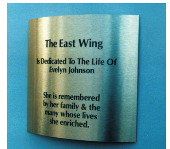
Brass Finished Without Endcaps Surface Applied Copy, On-Changeable Used As A Dedication Plaque