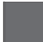
FORMAT C Single Piece Insert