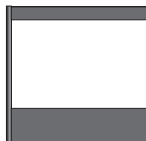
FORMAT A-1 Small Header & Standard Footer With Changeable Insert