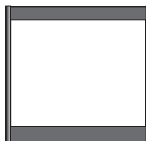
FORMAT A-2 Small Header & Small Footer With Changeable Insert