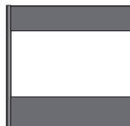
FORMAT A Header & Footer With Changeable Insert