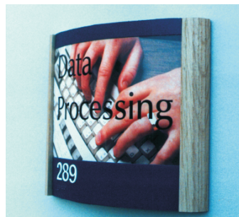
Department/Area Identification Large Oak Trim Strips And Raised & Braille Room Number