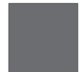
FORMAT D Single Piece Non Changeable Insert Without Endcaps