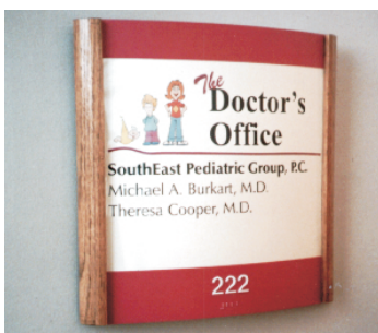
Suite Identification With Custom Logo Footer With Raised & Braille Cardstock Insert