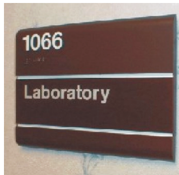
Raised & Braille # On Painted Acrylic Header