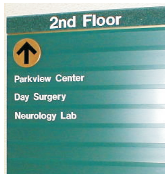
Solid Core Frame MultiStrip Directional Module