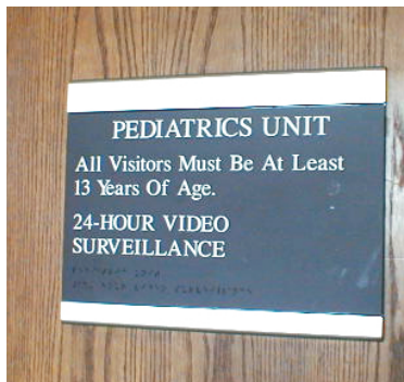
Brushed Aluminum Header/Footer ADA Compliant Photopolymer Insert