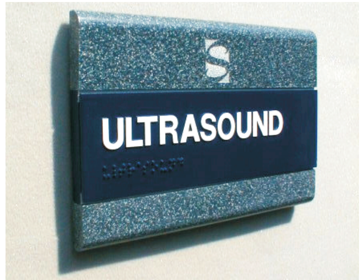
Shown With Solid Core Header/Footer, Photopolymer Insert, Sandcarved Logo

Reveals Can Contrast Or Match Background