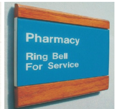
Oak Header & Footer, Subsurface Insert/Plaque